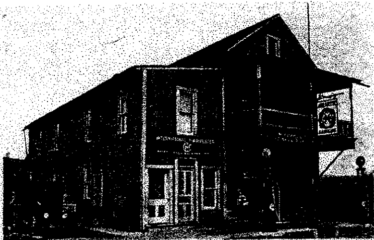
Before the service station came into being, gasoline was sold as a side line by a variety of businesses. Here it was a farm supply store at Markleysburg. Early 1900's.